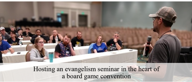
Hosting an evangelism seminar in the heart of a board game convention

We were thrilled with the turnout and the conversations! As one person put it, "I approached this discussion thinking 'how can faith be a subject matter in games?' But hearing everyone's perspectives opened me to seeing how games create a community, and how simply playing games (any games) can open up deeper conversation! That was something that didn't really occur to me before but I now see how it can be a great opportunity to build relationships!" Read our notes here .